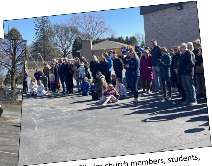
On March 10, Pilgrim church members, students, and families held a ceremonial groundbreaking to signal the beginning of construction.