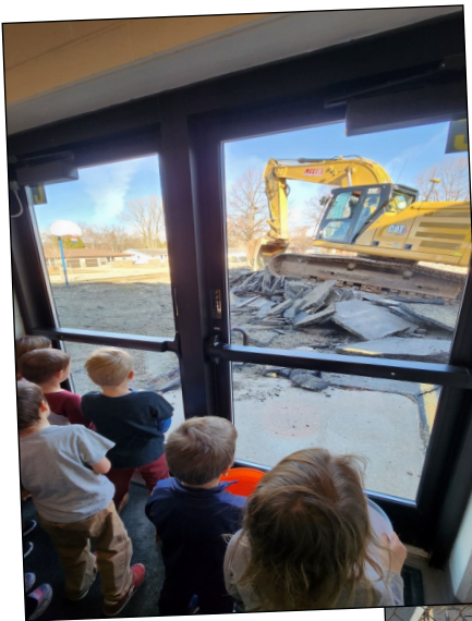
Pilgrim students witnessed the first day of construction work.

We ask God's continued blessings on this important work as our church and school work together to grow our space to "Save the lost and strengthen the saved".